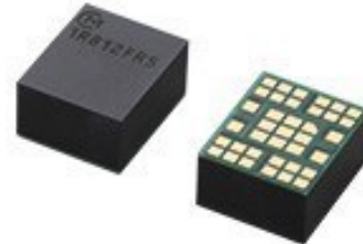
Encapsulated PSiP Murata 12 A MonoBlock POL 10.5 x 9.0 x 5.6 mm