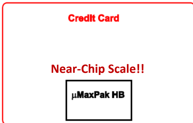
Figure 1: Credit Card Size Comparison. Thicknesses are Identical at 0.75 mm.

The 200kW SiC Inverter assumes efficiencies 99%, whereas Si IGBT Inverters are typically 97%. The Ultra-Thin \mu MaxPak double-sided (DS) cooled SMD package do not inhibit the SiC performance as is the case with traditional Si IGBT packages. More details are provided in the PSD article (1). The ultra-thin HB \mu MaxPak packages are each rate at 650V/650A, and only 1.142" long, 0.689" wide & 0.030" thick (29.0x17.5x0.75mm). See 650V/650A SiC \mu MaxPak HB size and thickness in Figure 1.